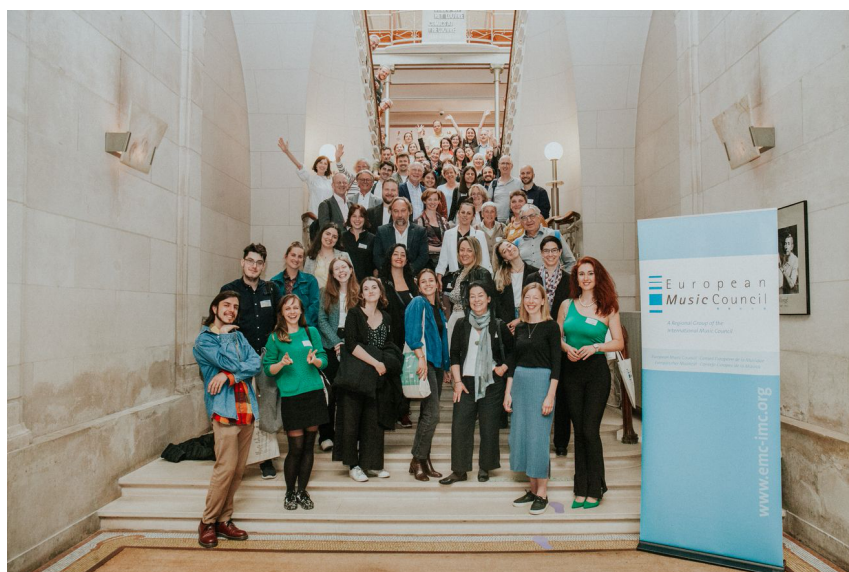
Delegates of the EMC Lab and General Assembly in Brussels