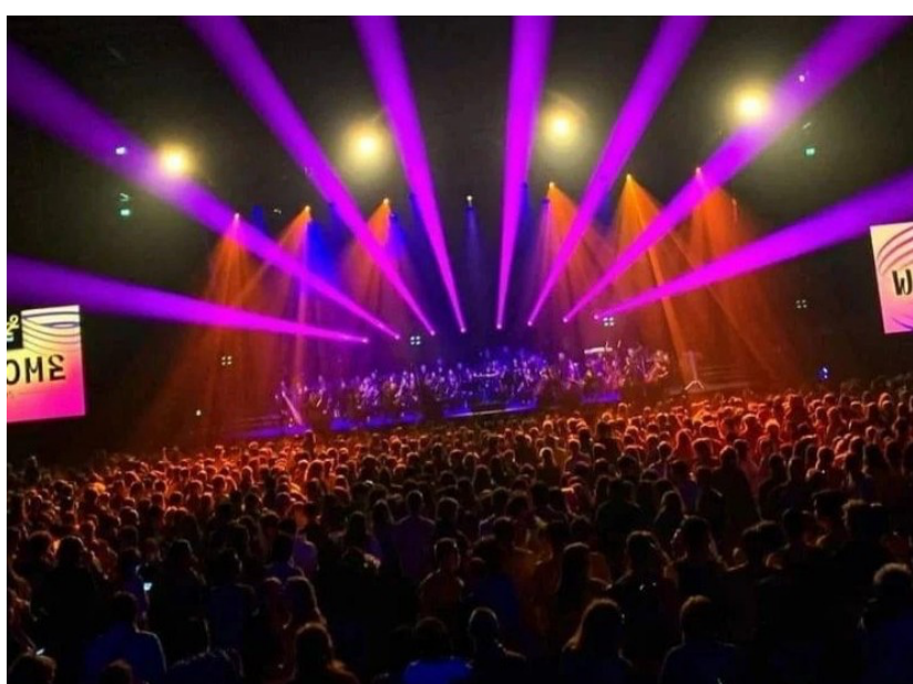
Opening ceremony of the Remix22 festival

The 14 th edition of the European Youth Music Festival entitled Remix22 took place from 26 to 28 May in Luxembourg. It brought together roughly 2.500 students from 15 countries to perform around 350 concerts. The festival took place in the frame of the European Capital of Culture 2022 Esch-sur-Alzette but featured performances on stages spread all around the country. The opening ceremony of the event took place in the Rockhal in the presence of H.R.H the Crown Princess Stéphanie–Wilhelmus.